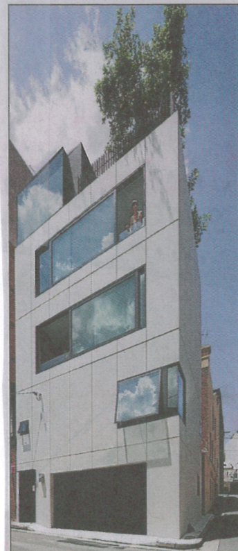
Another winner... the Small House in Surry Hills.